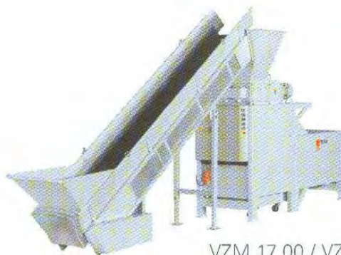
VZM 17.00 / VZM 18.00 Inline set-up